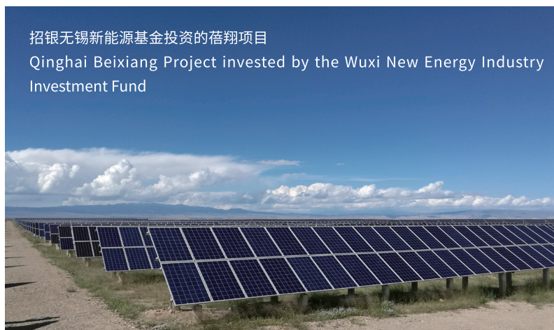
招银无锡新能源基金投资的蓓翔项目 Qinghai Beixiang Project invested by the Wuxi New Energy Industry Investment Fund

China Merchants Bank Wuxi New Energy Industry Investment Fund was established in December 2015, with the total fund size of RMB 10 billion and the first phase of RMB 2 billion, focusing on the M&A of photovoltaic power plant and technology investment in the new energy industry.