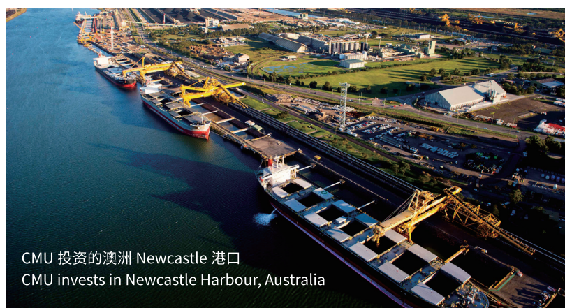
CMU 投资的澳洲 Newcastle 港口 CMU invests in Newcastle Harbour, Australia

成立于 2013 年 12 月，是以支持招商局主业进行海外战略性投资，建立收益稳定、风险可控的资产池为经营目的的海外投资平台。