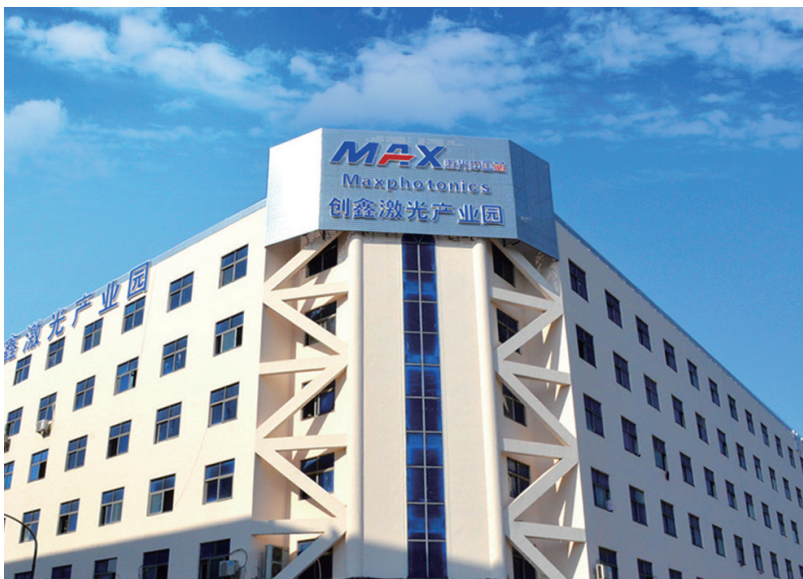
招商招银股权投资基金于 2018 年投资的创鑫激光项目 CMFOF invested Project Maxphotonics in 2018