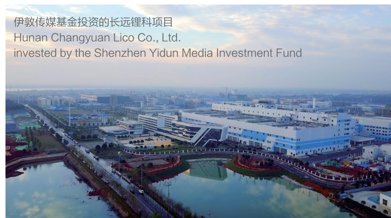
伊敦传媒基金投资的长远锂科项目 Hunan Changyuan Lico Co., Ltd. invested by the Shenzhen Yidun Media Investment Fund

2016 年 8 月设立，总规模为 50 亿元，首期规模 20 亿元，主要投资于媒体、互联网、文化、科技、金融等相关项目或企业。