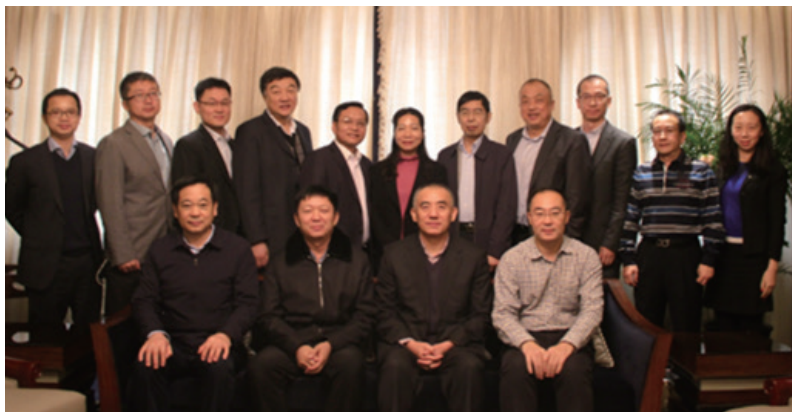
新招基金 2017 年第三届董监事合影 (Group Photo of the third board of directors of ZhongXinJian China Merchants Equity Investment Fund)

ZXJ & China Merchants Private Equity Fund was founded in October 2011 with a total size equivalent to RMB 7.5 billion. The fund focuses on several sectors such as financial service, energy, modern agriculture, biotechnology and basic industries, and has nationwide coverage with strong Xinjiang focus.